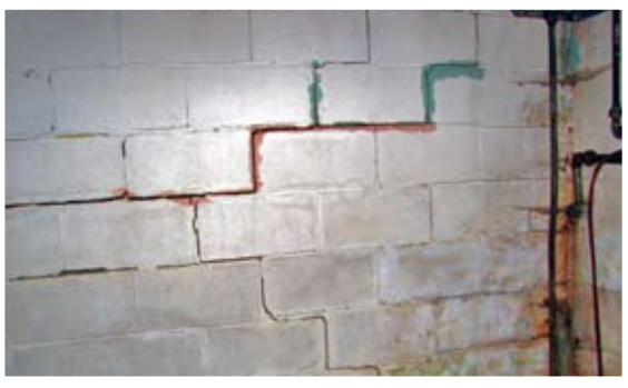
Cracks and water damage in basement